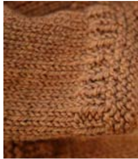
click to enlarge