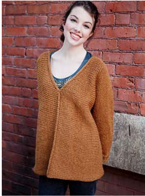
click to enlarge